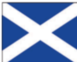
5. Down (8)