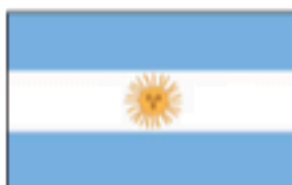
1. Across (9)