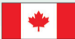
4. Down (6)

Use the picture clues to work out some of the teams competing in the 2026 Men's World Cup. Write them in the grid to solve the crossword puzzle.