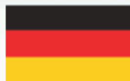
9. Across (7)