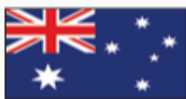
2. Down (9)