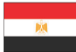
3. Across (5)