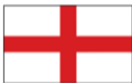
8. Across (7)