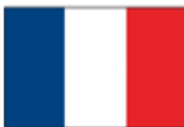
6. Down (6)