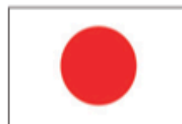
7. Across (5)